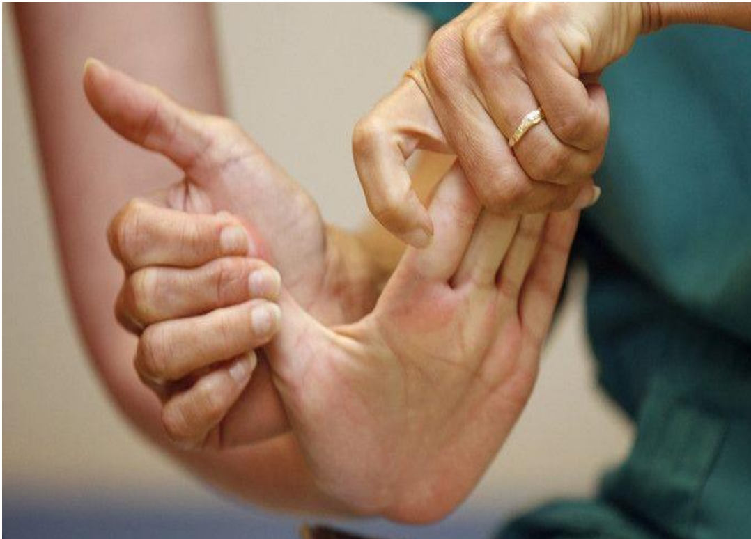
By The Therapist